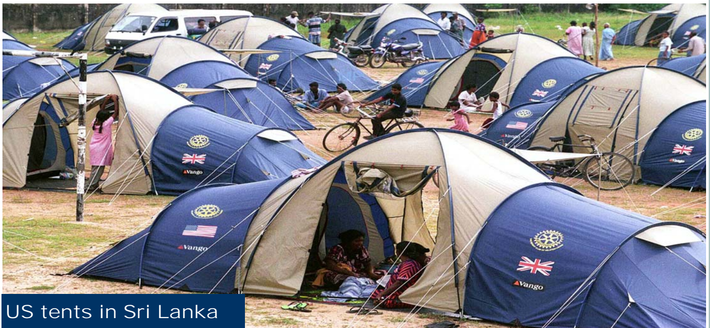
US tents in Sri Lanka